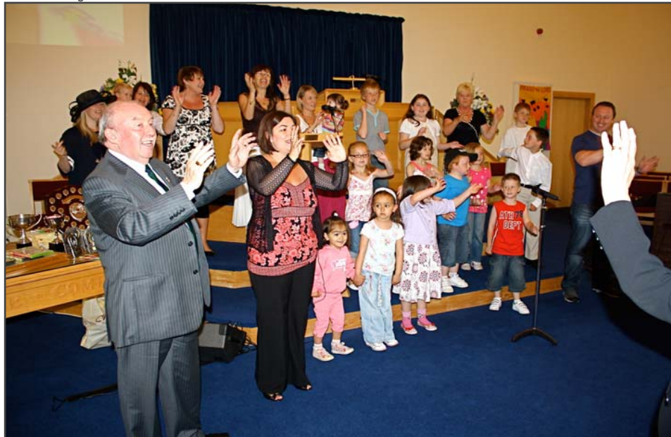
A happy group of children at the Sunday Club Prize-giving. The Sunday Club meet each Sunday Morning 11.30 am in the Christchurch Great Hall - some children join with the church at 11.00am.