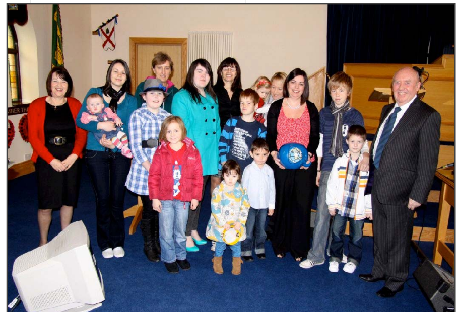
The Christchurch Sunday Club dedicated their offerings to the Shelterbox Appeal for Haiti.