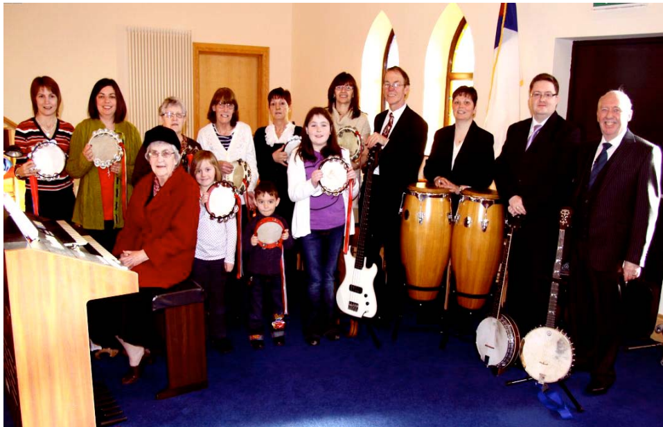
The Christchurch Praise Band: The combined Timbrel band and musicians make up the Christchurch Praise Band which play every week at the services.