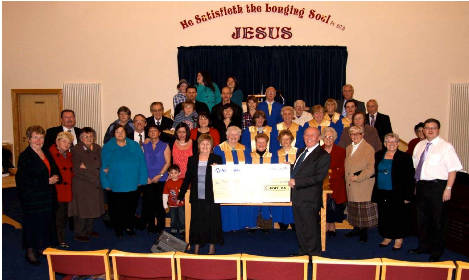
A happy group at Christchurch holding the Cheque for the funds raised for the Shelterbox appeal to help in the aftermath of Haiti Earthquake.