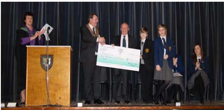
Belfast High present their cheque in their morning Assembly.