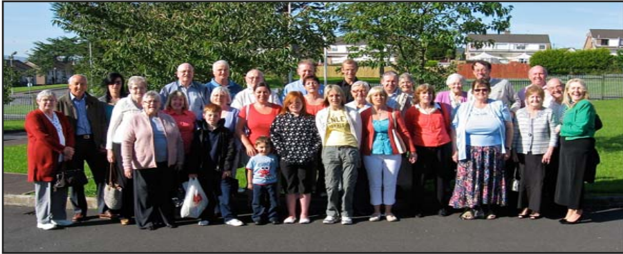
A happy group from Christchurch enjoying a day out to Ballymena