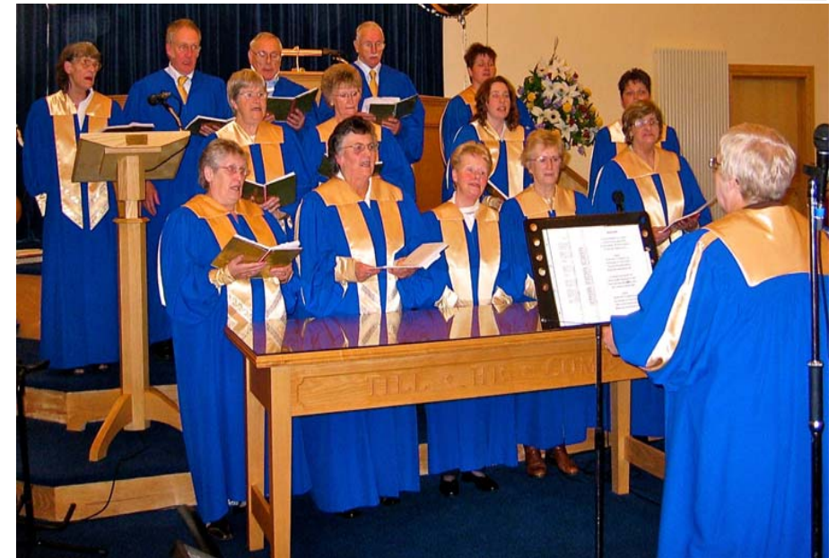
The Christchurch Choir sing every Sunday evening. Service at 6.30 pm.